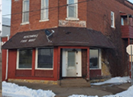
Mitchell Maskrey Mill