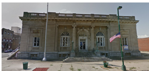
Former Clinton Post Office, Clinton, IA

Community-wide grant funds will be used to conduct up to 24 environmental site assessments to prioritize sites while assembling a brownfield inventory. Funds will also be used to develop up to 15 cleanup plans and support community outreach activities. While assessment activities will focus on the ECIA region, the funding primarily focuses on areas in Clinton, Delaware and Jackson counties that lie in Qualified Opportunity Zones. Priority sites include the former Clinton Engines site in Maquoketa, Jackson County Regional Health Center, Walker’s Salvage site in DeWitt, former U.S. Post Office in Clinton, former Tyco Electronics site in Sabula, and former Lincoln School in Manchester.