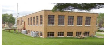
Former Clinton Engines Site, Maquoketa, IA

In May, the Environmental Protection Agency (EPA) awarded ECIA a $600,000 Brownfields Assessment Coalition Grant. The EPA has delivered approximately $287 million in Brownfield grants directly to communities and nonprofits for cleanup and redevelopment, job creation, and economic development through the award of over 948 grants.